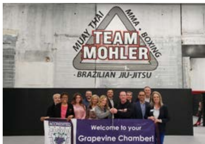
January 8, 2019 Mohler MMA