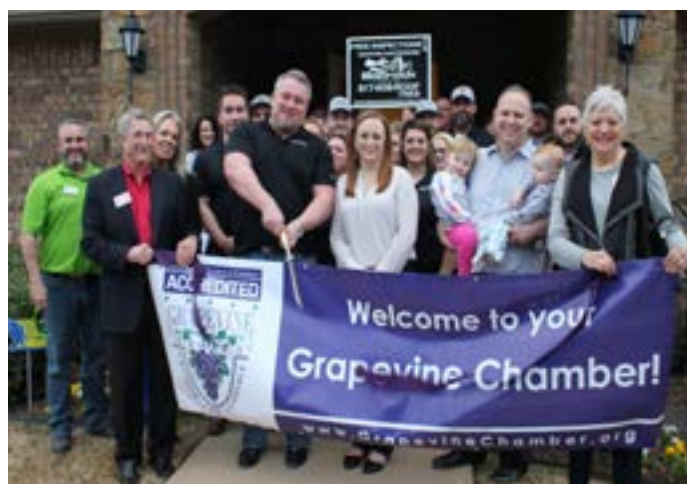
February 16, 2019 Bedrock Contracting